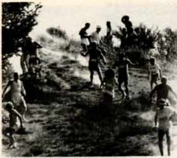
Down the hill into Muir Woods in the 1975 Dipsea.