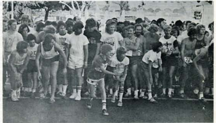
Start of Vallejo's Channel-to-Lake 10-Miler.