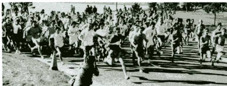
Start of the First Annual Run 'n Swim Biathlon at Redwood Shores... note the squeeze-play on the far left!