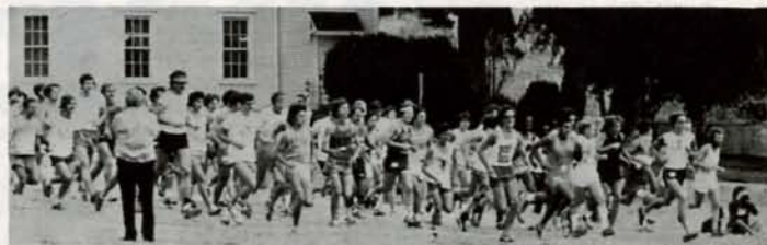
Start of the 15.1-Mile Ft. Baker Handicap Race.