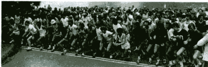
Start of the Angwin-to-Angwish Run.